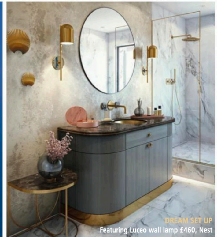
DREAM SET UP Featuring Luceo wall lamp £460, Nest